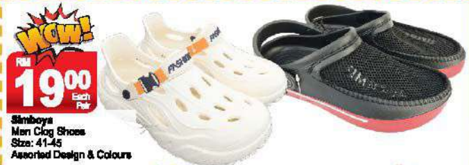
Simboya Men Clog Shoes Size: 41-45 Assorted Design & Colours RM 19.00 Each Pair