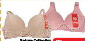
Sakura Collection Ladies Bra Size: 34-44 Cup: B-D Assorted Design & Colours RM 10.00 Each