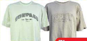
Urban Style Men T-Shirt Size: S-2XL Assorted Design & Colours RM 32.00 Each