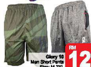
Glory 10 Men Short Pants Size: M-2XL RM 12.00 Each