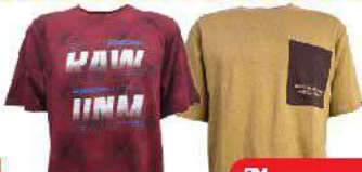
Urban Style Men T-Shirt Size: S-4XL Assorted Design & Colours RM 17.00 Each