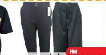
Lovine Ladies Long Sock Pants Size: XS-XL Assorted Design & Colours RM 28.00 Each