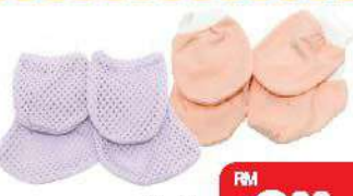
Piya Piya Baby Mitten Booties Set Assorted Design & Colours RM 6.00 Each