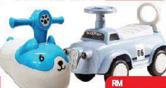
Piya Piya Baby Ride On Car With Music Assorted Design & Colours RM 35.00 Each