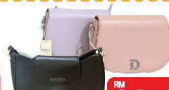
Anieta Collection Ladies Crossbody Bag Assorted Design & Colours RM 29.00 Each