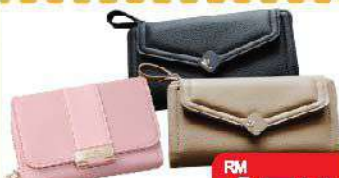
Anieta Collection Ladies Wallet Assorted Design & Colours RM 17.00 Each