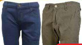
Arlando Lossini Men Half Pants Size: M-XL / 28-38 Assorted Design & Colours RM 25.00 Each