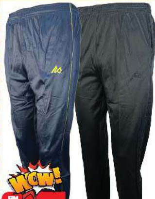
Glory 10 Adult Track Pants Size: 36-50 Assorted Design & Colours RM 15.00 Each