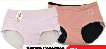
Sakura Collection Ladies Panties Size: M-3XL Assorted Design & Colours 2x/3x RM 12.00 Each