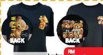
Lovine Ladies T-Shirt Size: L-XL Assorted Design & Colours RM 10.00 Each