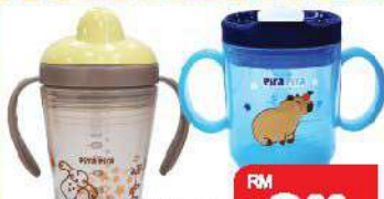
Piya Piya Baby Train Cup Assorted Design & Colours RM 8.00 Each