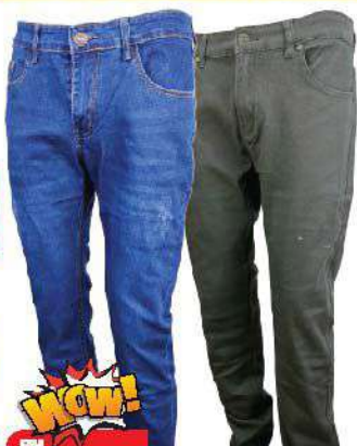
Arlando Lossini Men Long Pant Size: 28-48 Assorted Design & Colours RM 39.00 Each