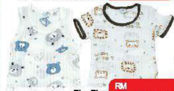
Piya Piya Baby Suit Size: 0-18months Assorted Design & Colours RM 12.00 Each