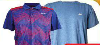
Glory 10 Adult Sport T-Shirt Size: S-4XL Assorted Design & Colours RM 17.00 Each