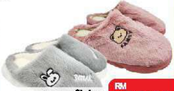
Simboya Indoor Slipper Size: 36-46 Assorted Design & Colours RM 10.00 Each Pair