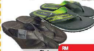
Simboya Men Slipper Size: 40-46 Assorted Design & Colours RM 12.00 Each Pair