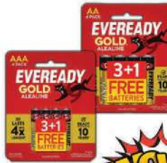
Eveready Gold Alkaline Battery 3pcs Free 1pc AA/AAA