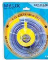
Milux Regulator Clam Shell Packaging With Safety Valve M168CS