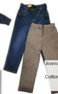
Jaya Kids Boy Long Pants Size: 26-34 Assorted Design & Colours