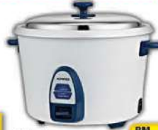
Khind Traditional Aluminium Rice Cooker RCR28N 2.8L 670W