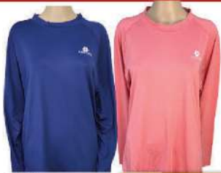
Lovine Ladies Long Sleeve Fitness Sports Tee Size: M-2XL Assorted Colours RM 19 Each