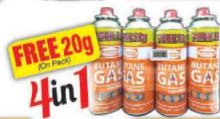
Kenware Butane Gas Cartridge 4s 230*20g