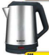
Sabichi SUS304 Jug Kettle TP-1806 2L 1500W

PRC-6E 0.6L 300W PRC-11E 1L 400W PRC-18E 1.8L 700W RM 58.90 RM 66.90 RM 84.90 Each