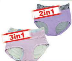
Lovine Ladies Panties Size: M-3XL/Free Size Assorted Design & Colours 2s/3s RM 12 Each