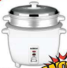
Sabichi Aluminium Rice Cooker With Steamer