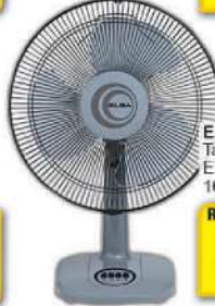
Elba Table Fan ETF-G1620(GR) 16" 50W