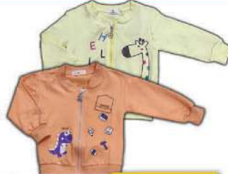
Piya Piya Baby Jacket Size: S-XL Assorted Design & Colours