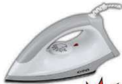
Khind Non-Slick Dry Iron E1405 1300W