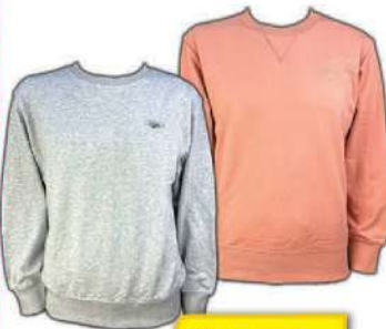
Lovine Men Long Sleeve Sweater Size: S-2XL Assorted Colours RM 45 Each