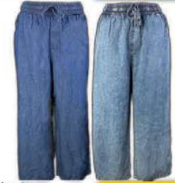
Lovine Ladies Jeans Culottes Size: Free Size Assorted Colours RM 32 Each