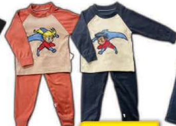
Kids Pyjamas Size: 10-14/90-120 Assorted Design & Colours