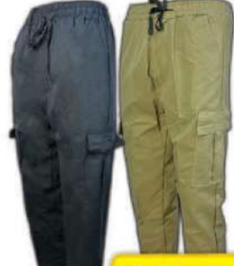
Lovine Men Cargo Pants Size: S-XL Assorted Design & Colours RM 17 Each