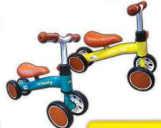
Piya Piya Baby Balance Bike Assorted Colours