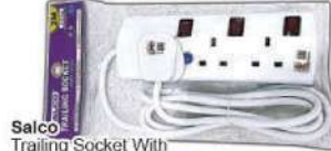
Salco Trailing Socket With Neon 1.25mm 2m

933N-2M 3 Gang 934N-2m 4 Gang RM 17.90 RM 18.90 Each