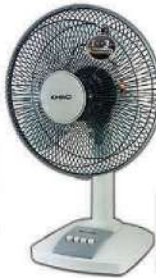
Khind Table Fan TF-126SE 12" 40W