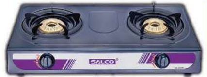
Salco Epoxy Double Gas Stove SAL-8205N 100mm x 2