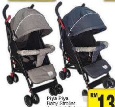
Piya Piya Baby Stroller Assorted Colours