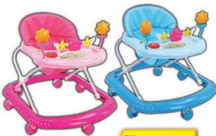
Piya Piya Baby Walker No Stopper Assorted Colours