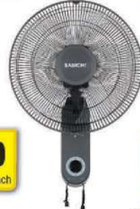
Sabichi Wall Fan SWF-940/SWF-1440 16" 50W