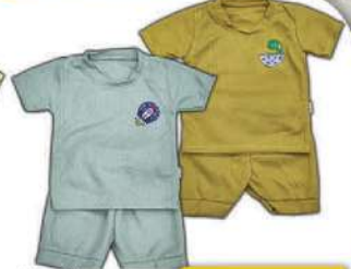
Piya Piya Baby Suit Size: Free Size Assorted Design & Colours