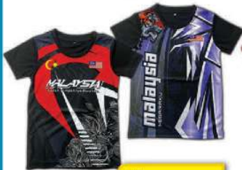
Kids Tee Size: 6-16/26-30 Assorted Design & Colours