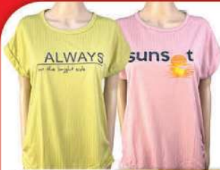
Lovine Ladies T-Shirt Size: L-XL Assorted Design & Colours RM 8 Each