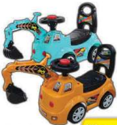
Piya Piya Baby Ride On Excavator With Music Assorted Colours