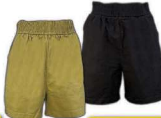
Lovine Ladies Half Pant Size: M-2XL Assorted Colours RM 22 Each