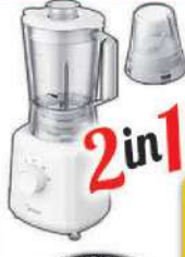
Midea 2in1 Blender MBL-6010W 1.25L 600W