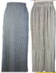
Lovine Ladies Long Skirt Size: Free Size Assorted Design & Colours RM 19 Each