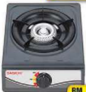
Sabichi Epoxy Single Gas Stove GS-8119 100mm