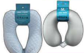
AC Lifestyle Memory Foam Neck Rest (Cool Touch) Size: 26x29cm/29.5x30cm Assorted Colours RM 19 Each