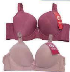
Lovine Ladies Bra Size: 34-50 Cup: B-D Assorted Design & Colours RM 10 Each