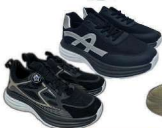
Vento Men Sport Shoes Size: 41-46 Assorted Design & Colours RM 49 Each Pair