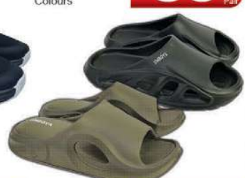
Lovine Men Slipper Size: 41-46 Assorted Design & Colours RM 17 Each Pair