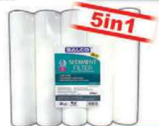
Salco Sediment Filter 5in1 5 Micron FL 85-5 85g x 5