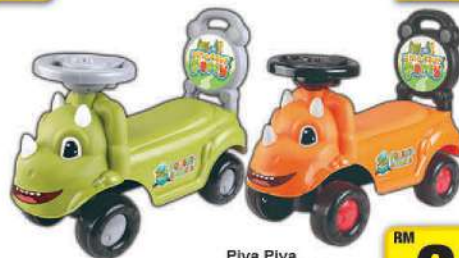
Piya Piya Baby Ride On Dinosaur With Music Assorted Colours