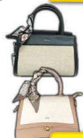
Anista Collection Ladies Satchel Bag Assorted Design & Colours RM 45 Each