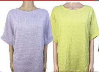
Lovine Ladies Blouse Size: Free Size Assorted Design & Colours RM 22 Each