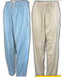
Lovine Ladies Long Pants Size: M-2XL Assorted Design & Colours RM 22 Each