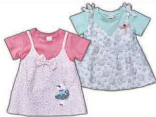
Piya Piya Baby Girl Dress Size: 0-24months Assorted Design & Colours