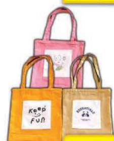
Sakura Collection Tote Bag Assorted Design & Colours RM 10 Each