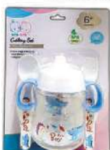
Piya Piya Baby Cullery Set 4s Assorted Colours