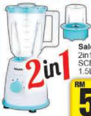
Salco 2in1 Blender SCB-205G/B 1.5L 300W