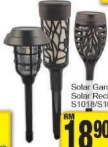
Solar Garden Pathway Light Solar Rechargeable S1018/S1019/S1021