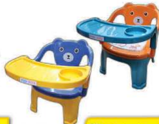
Piya Piya Baby Chair Assorted Colours