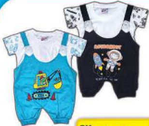
Baby Jumper Size: S-L Assorted Design & Colours