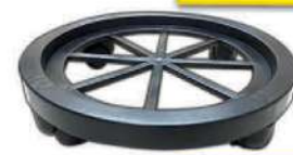
Kilat 4 Wheel Heavy Duty Gas Roller 34cm