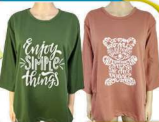
Lovine Ladies Blouse Size: L-XL Assorted Design & Colours RM 17 Each