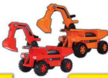
Piya Piya Baby Ride On Excavator With Music Assorted Colours