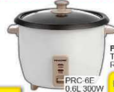
Pensonic Traditional Non-Slick Rice Cooker

PRC-6E 0.6L 300W PRC-11E 1L 400W PRC-18E 1.8L 700W RM 58.90 RM 66.90 RM 84.90 Each