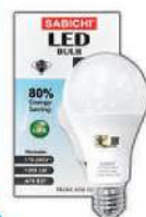
Sabichi LED Bulb 15W A70-15CDL/A70- 15W