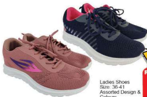
Lovine Ladies Shoes Size: 36-41 Assorted Design & Colours RM 35 Each Pair