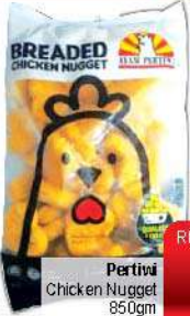
Pertiva Chicken Nugget 850gm