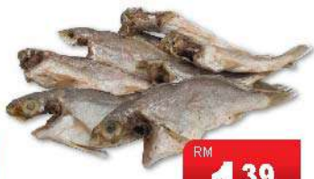
Ikan Masin Gelama