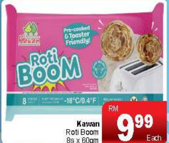
Kawan Roti Boom 8s x 60gm