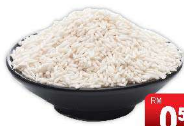
Beras Pulut Putih