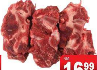
Daging Chuck Bone