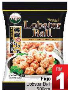
Figolob Lobster Ball 500gm