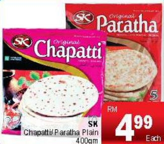
SK Chapatti Paratha Plain 400gm