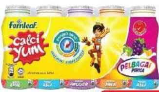
Fernelaf Caldi Yum Cultured Milk Drink (Assorted) 5s x 110ml