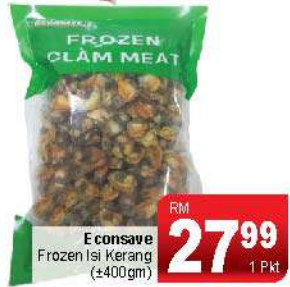
Ecosave Frozen Isi Kerang (±400gm)