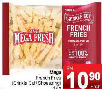
Mega French Fries (Crinkle Cut/ Shoestring) 1Kg