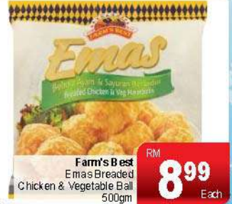
Farm's Best Emas Breaded Chicken & Vegetable Ball 500gm