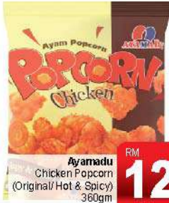
Ayamadu Chicken Popcorn (Original/ Hot & Spicy) 360gm