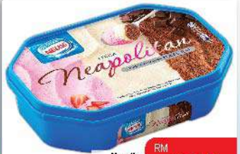
Nestle Ice Cream (Assorted) 1.5L