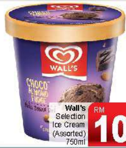
Wall's Selection Ice Cream (Assorted) 750ml