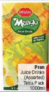
Pranj Juice Drinks (Assorted) Tetra Pack 1000ml