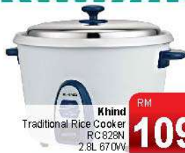
RM 109.00 Each Khind Traditional Rice Cooker RC 828N 2.8L 670W