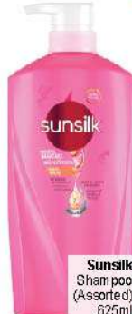
Sunsilk Shampoo (Assorted) 625ml