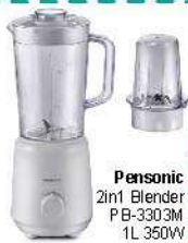
RM 79.90 Each Pensonic 2in1 Blender PB-3303M 1L 350W