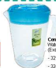
RM 3.90 RM 8.90 Century Water Jug (Exclude Bintangor) - 321 1.2L - 324 4.5L