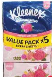
Kleenex Facial Tissue 3PLY (Assorted) (5 x 80s/5 x 90s)