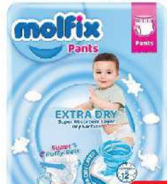
Molfix Extra Dry Pants Jumbo Pack (M58/L48/XL42/XXL36)