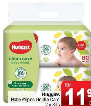
Huggies Baby Wipes Gentle Care 2 x 80s