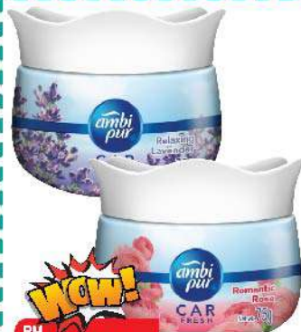
RM 6.90 Each Wow! Ambi Pur Car Gel Assorted Fragrances 75gm (Exclude Bintulu)