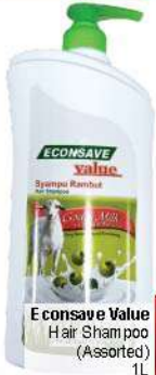
Econsave Value Hair Shampoo (Assorted) 1L