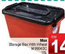
RM 14.90 Each Max Storage Box With Wheel M9904SC 15L