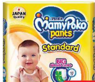
Mamy Poko Standard Super Jumbo Pack (M60/L48/XL40/XXL32)