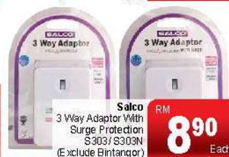
RM 8.90 Each Salco 3 Way Adaptor With Surge Protection S303/S303N (Exclude Bintangor)