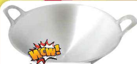
Wow! Gordang Polished Aluminium Wok (Exclude Bintangor & Bintulu)