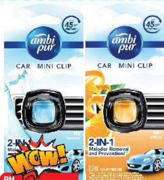
RM 11.90 Each Wow! Ambi Pur Car Vert Clip Air Freshener 2.2ml Assorted Fragrances