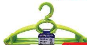
RM 5.90 Each Max Child Hanger 18s M033/M8 (Exclude Bintangor)