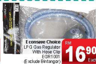
RM 16.90 Each Econsave Choice LPG Gas Regulator With Hose Clip EGR1001 (Exclude Bintangor)