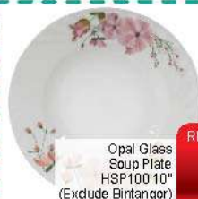
RM 6.90 Each Opal Glass Soup Plate HSP10010" (Exclude Bintangor)