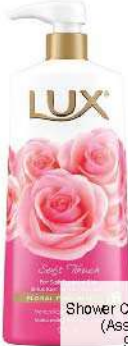
Lux Shower Cream (Assorted) 950ml