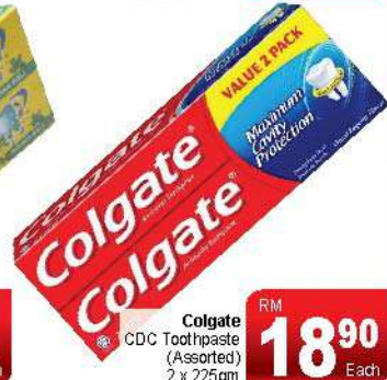
Colgate CDC Toothpaste (Assorted) 2 x 225gm