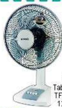
RM 79.90 Each Khind Table Fan TF 126SE 12" 40W