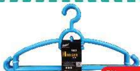
RM 4.90 Each Century Hanger 6s 8008A