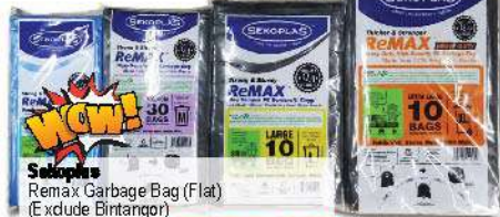
Wow! Sekoplas Remax Garbage Bag (Flat) (Exclude Bintangor)