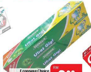
Econsave Choice Toothpaste (Natural Mint/ Freshmint) 2 x 250gm