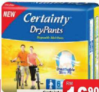
Certainty Drypants (M10/L9/XL8/XXL6)