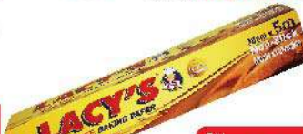
RM 7.90 Each Lacy's Baking & Cooking Paper 30cm x 5m