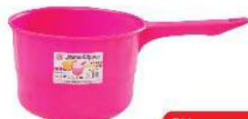
RM 3.50 Each Max Water Dipper M2679 L305 x W175 x H120mm