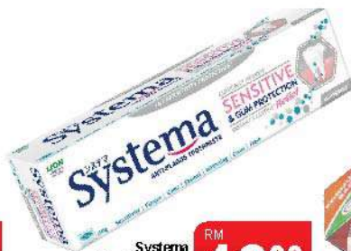
Systema Sensitive Toothpaste (Assorted) 100gm - 130gm