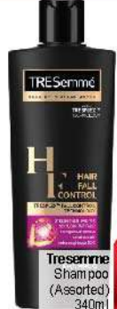
TRESemme Shampoo (Assorted) 340ml