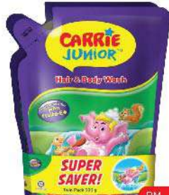
Carrie Junior Hair & Body Wash Pouch (Assorted) 2 x 500gm