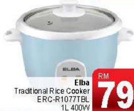
RM 79.90 Each Elba Traditional Rice Cooker ERC-R1077TEL 1L 400W