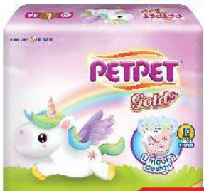
Pet Pet Gold + Pants (Unicorn) Super Jumbo Pack (M56/L46/XL38/XXL32)