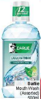
DARLIE Mouth Wash (Assorted) 500ml