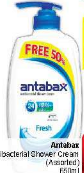
Antabax Antibacterial Shower Cream (Assorted) 650ml