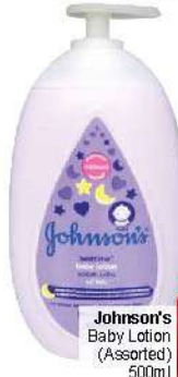
Johnson's Baby Lotion (Assorted) 500ml