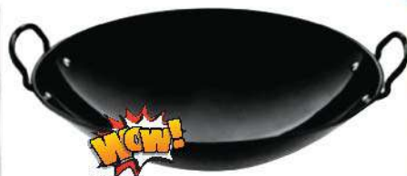
Wow! Shamoi Enamel Wok FT-02102