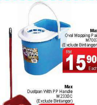
RM 6.90 Each Max Dustpan With PP Handle M233SC (Exclude Bintangor)