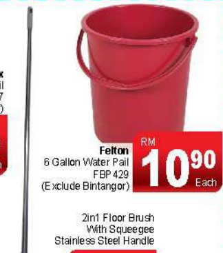
RM 10.90 Each Felton 6 Gallon Water Pail FBP 429 (Exclude Bintangor)