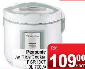
RM 109.00 Each Pensonic Jar Rice Cooker P SR1807 1.8L 700W