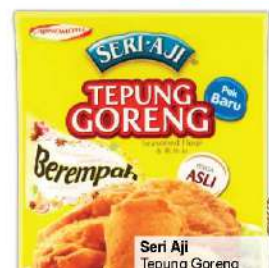
Seri Aji Tepung Goreng 150gm - Asli - Pedas