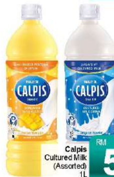
Calpis Cultured Milk (Assorted) 1L