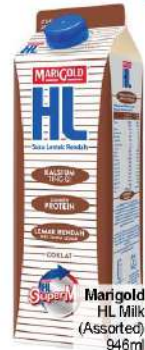
Mangold HL Milk (Assorted) 946ml