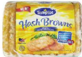
Simplot Hash Brown 637gm