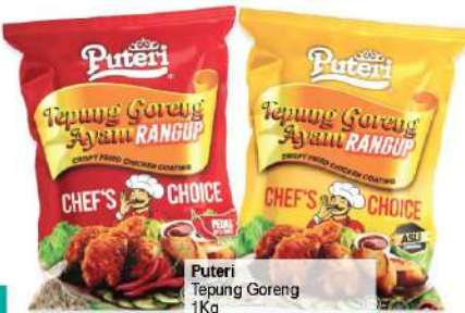
Puteri Tepung Goreng 1Kg - Asli - Spicy