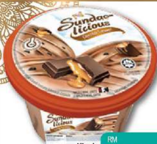
King's Sundae-Licious (Assorted) 800ml