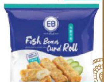
EB Fish Bean Curd Roll 300gm (Exclude Bintangor)