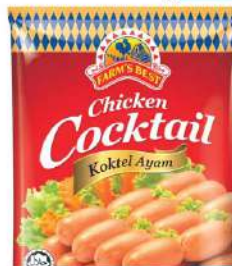
Farm's Best Chicken Cocktail (Cheese/ Blackpepper) 500gm (Exclude Bintangor)