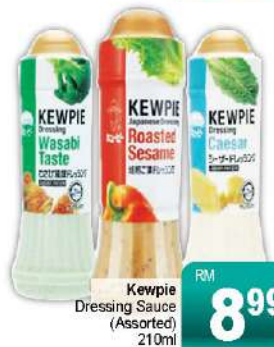
Kewpie Dressing Sauce (Assorted) 210ml