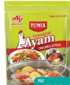
Tumix Chicken Pouch 330g