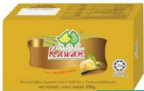
Kawan Premium Spread 250gm