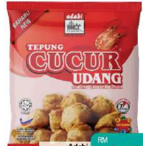
Adabi Tepung Cucur (Assorted) 200gm