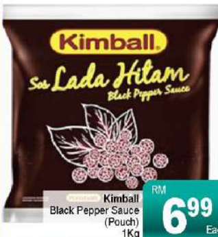
Kimball Black Pepper Sauce (Pouch) 1Kg