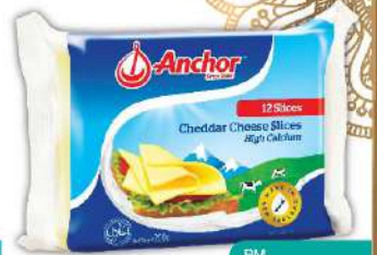
Anchor Cheddar Cheese 200gm