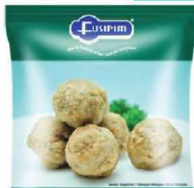
Fusipim Beef Ball 900gm (Exclude Bintangor)