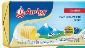
Anchor Salted/Unsalted Butter 227gm