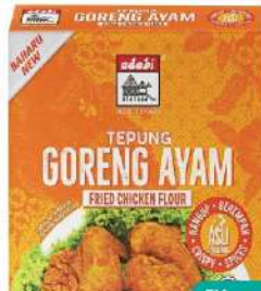
Adabi Tepung Goreng Ayam (Original/ Hot & Spicy) 100g