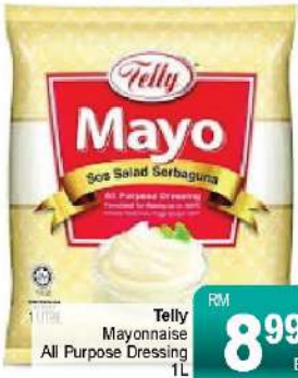
Telly Mayonnaise All Purpose Dressing 1L