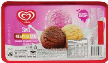
Wall's Ice Cream (Assorted) 1.4L