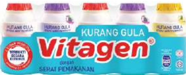
Vitagen Less Sugar (Assorted) 5 x 125ml