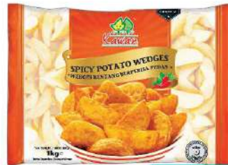
Kawan Spicy Wedges 1Kg