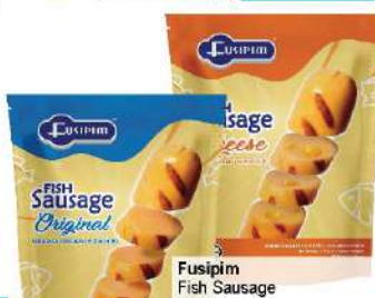
Fusipim Fish Sausage 200gm (Exclude Bintangor) - Original RM4.99 - Cheese RM5.49