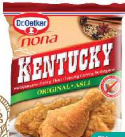
Dr. Oetker Nona Kentucky Flour (Original/ Hot & Spicy) 850g