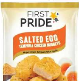
First Pride Nugget (Assorted) 700gm (Exclude Bintangor)