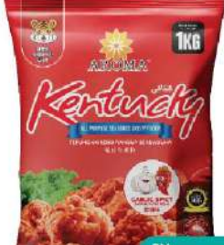
Aroma Kentucky Flour (Spicy & Garlic Spicy) 1Kg