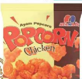
Ayamadu Chicken Popcorn (Assorted) 360/ 400gm (Exclude Bintangor)