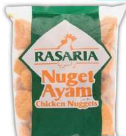
Rasaria Chicken Nugget 1kg (Exclude Bintangor)