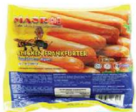
Masroi Honey Chicken Frankfurter 300gm