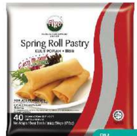
Figo Spring Roll Pastry (7.5" 8.5") 500gm