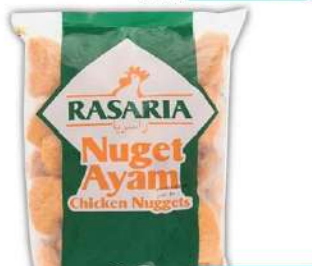
Rasaria Chicken Nugget 1kg (Exclude Bintangor)