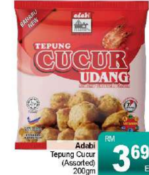
Adabi Tepung Cucur (Assorted) 200gm