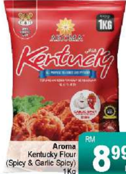
Aroma Kentucky Flour (Spicy & Garlic Spicy) 1Kg