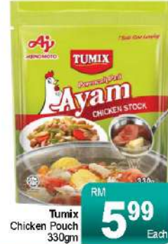
Tumix Chicken Pouch 330gm