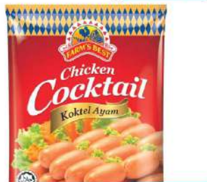
Farm's Best Chicken Cocktail (Cheese/ Blackpepper) 500gm (Exclude Bintangor)