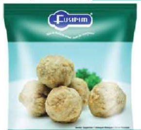
Fusipim Beef Ball 900gm (Exclude Bintangor)