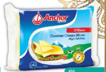
Anchor Cheddar Cheese 200gm