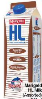
Mangold HL Milk (Assorted) 946ml