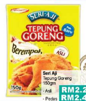
Seri Aji Tepung Goreng 150gm - Asli - Pedas