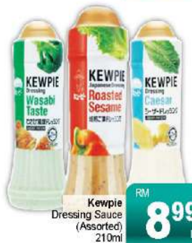
Kewpie Dressing Sauce (Assorted) 210ml