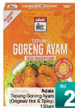
Adabi Tepung Goreng Ayam (Original/ Hot & Spicy) 100gm