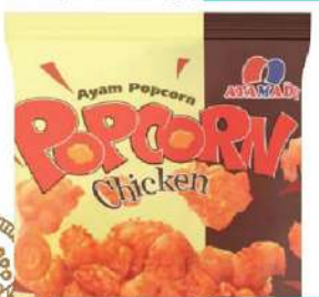
Ayamadu Chicken Popcorn (Assorted) 360/ 400gm (Exclude Bintangor)