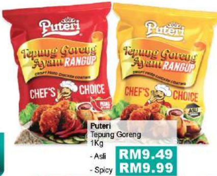
Puteri Tepung Goreng 1Kg - Asli - Spicy