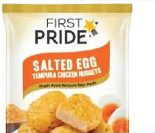
First Pride Nugget (Assorted) 700gm (Exclude Bintangor)