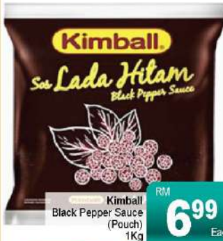
Kimball Black Pepper Sauce (Pouch) 1Kg