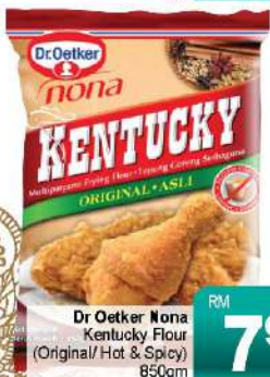
Dr. Oetker Nona Kentucky Flour (Original/ Hot & Spicy) 850gm