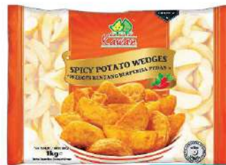
Kawan Spicy Wedges 1Kg