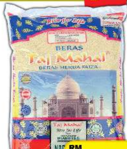
Taj Mahal Herba Ponni Rice 5Kg