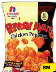
Ayamadu Chicken Popcorn (Original/ Hot & Spicy) 360gm/ 400gm