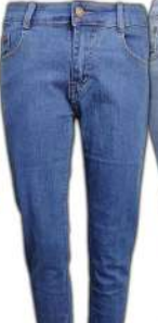
Lovine Ladies Long Slim Jeans Size:28-33/XS-2XL Assorted Design & Colours