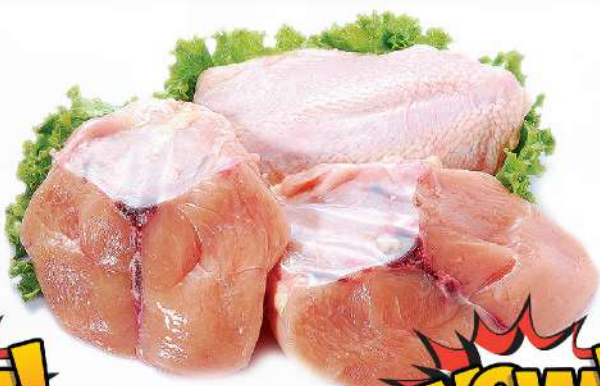
Dada Ayam Bertulang Lembut