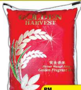
Golden Harvest Fragrant Rice 10Kg