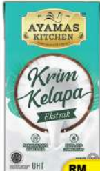
Ayamas Kitchen Coconut Cream 1L