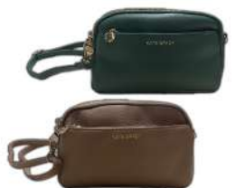
Sakura Collection Ladies Crossbody Bag Assorted Design & Colours