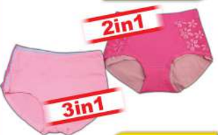
Ladies Panties Size:M-3XL/Free Size Assorted Design & Colours 2s/3s