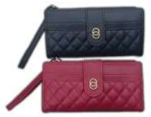
Sakura Collection Ladies Wallet Assorted Design & Colours