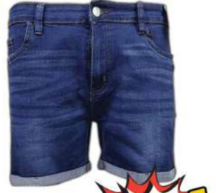
Ladies Short/ Half Jeans Pant Size:28-34 Assorted Design & Colours