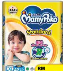
Mamy Poko Standard Super Jumbo Pack (M66/ L54/ XL42)