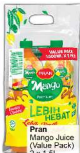
Pran Mango Juice (Value Pack) 2 x 1.5L