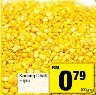
Kacang Dhal Hijau