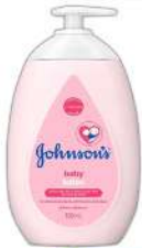
Johnson's Baby Lotion (Assorted) 500ml