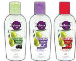
Belluvia Olive Oil (Assorted) 150ml