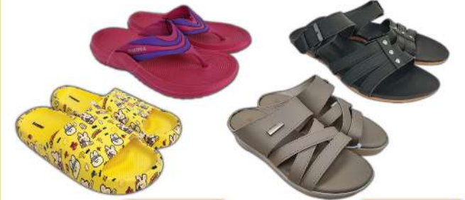
Ladies Slipper Size:35-41 Assorted Design & Colours