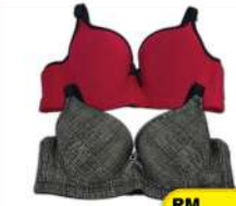
Ladies Bra Size:32-50 Cup: A-D Assorted Design & Colours