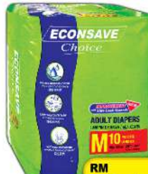
Econsave Choice Adult Diapers (M10/ L8/ XL8)