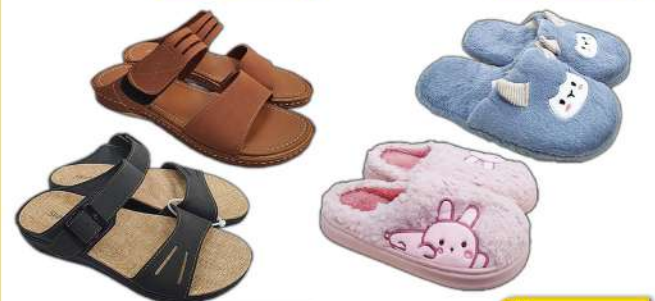
Ladies Sandal Size:36-40 Assorted Design & Colours