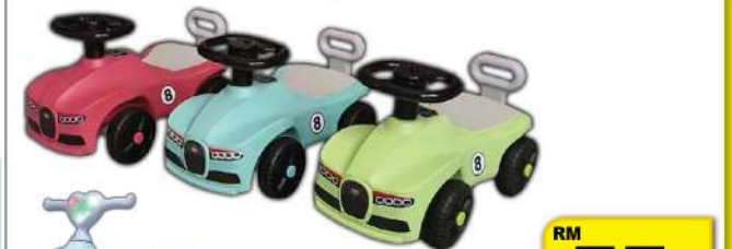
Hi Baby Ride On Car With Music Assorted Colours