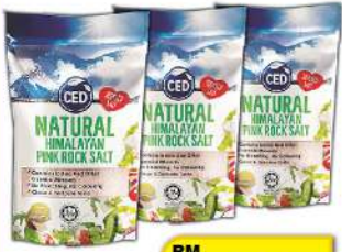
CED Natural Pink Salt Iodised 3 x 500gm