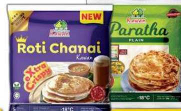
Kawan Roti Chanai/ Roti Paratha Plain 5s x 80gm