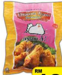
Ayam A1 Chicken Drummet 700gm