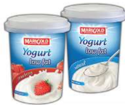
Marigold Low Fat Yogurt Cup (Assorted) 130gm