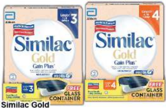
Similac Gold Gain Plus BIB 1.8Kg -Step 3 -Step 4