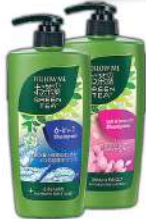
Follow Me Green Tea Shampoo (Assorted) 650ml