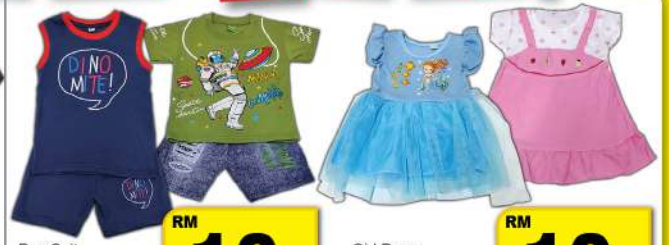
Boy Suit Size:2-8/S-2XL Assorted Design & Colours