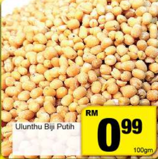
Ulunthu Biji Putih