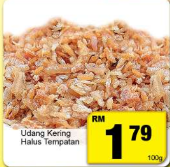
Udang Kering Halus Tempatan

(6/10) RM29.90 (10/20) RM25.90 (20/40) RM18.90 Each