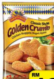
Farm's Best Golden Crumb Nugget 1Kg