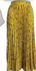
Lovine Ladies Long Skirt Size:Free Size Assorted Design & Colours