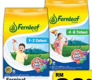
Fernleaf Calci Yum/ Growing Up Milk Powder 1-3/ 4-6 (Assorted) 900gm 12 x 900gm