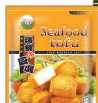
Figo Seafood Tofu/ Cheesy Fish Curd/ Lobsters Ball 500gm