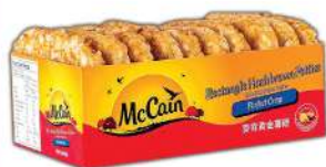
McCain Hashbrown 650gm