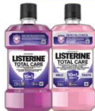
Listerine Mouth Wash (Assorted) 250ml