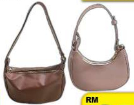
Sakura Collection Ladies Shoulder Bag Assorted Design & Colours