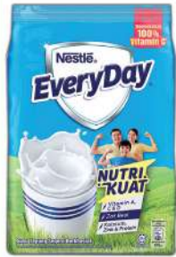
Nestle Everyday 1.5Kg 6 x 1.5Kg