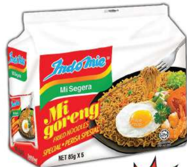
Indomie Fried Noodles (Asli/ Spesial) 5s x (80/ 85)gm 8 x 5s x (80/85)gm