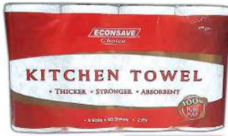
Econsave Choice Kitchen Towel 8 x 50s