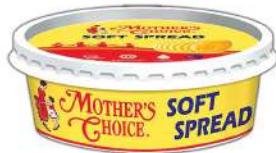
Mother's Choice Spread 250gm