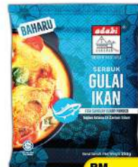
Adabi Serbuk Gulai (Ikan/ Daging) 250gm