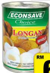
Econsave Choice Whole Longan 565gm 24 x 565gm