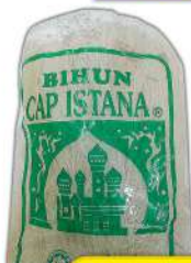
Cap Istana Bihun 3Kg