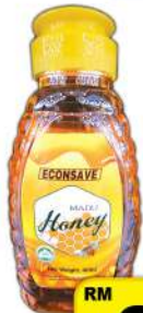
Econsave Honey 400gm

FREE 100gm (On Pack) RM 45.50 RM 43.50 Each