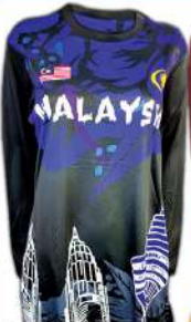
Ladies Tunic Size:S-2XL/Free Size Assorted Design & Colours