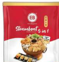
EB Steamboat 5in1 500gm