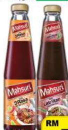
Mahsuri Sos Tiga Rasa/ Sos Lada Hitam 530gm/ 495gm