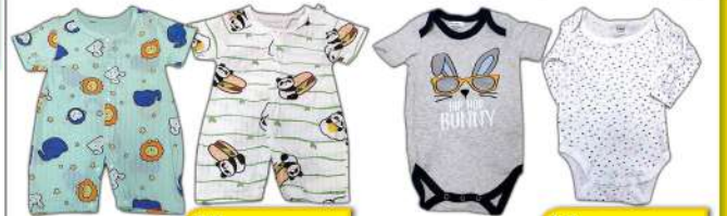
Piya Piya Baby Romper Size:66-80 Assorted Design & Colours