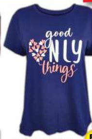
Ladies Short Sleeve T-Shirt Size:M-2XL Assorted Design & Colours