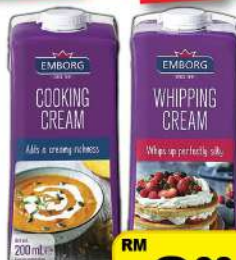
Emborg Cooking/ Whipping Cream 200gm