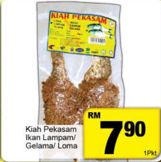
Kiah Pekasam Ikan Lampam/ Gelama/ Loma