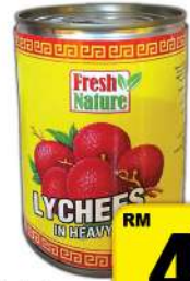
Fresh Nature Lychees In Syrup 567gm 24 x 567gm