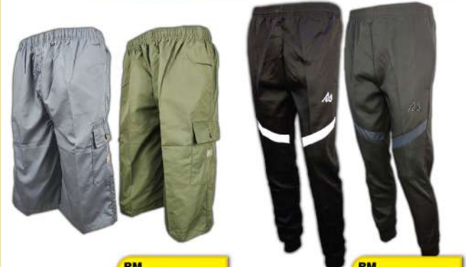
E&S Men 3/4 Cargo Pant Size:2XL-4XL Assorted Colours