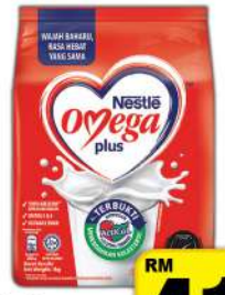
Nestle Omega Plus Regular/ Dark Choco 1Kg/ 900gm 12 x 1Kg/ 900gm