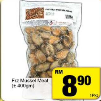
Frz Mussel Meat (± 400gm)