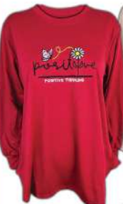
Lovine Ladies Long Sleeve T-Shirt Size:Free Size Assorted Design & Colours