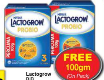
Lactogrow BIB 2 x 600gm -Step 3 -Step 4

FREE 100gm (On Pack) RM 45.50 RM 43.50 Each