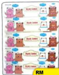
Royale Comfort Softpack Tissue 3Ply 5 x 80s