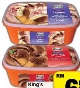
King's Ice Cream (Assorted) 1.2L