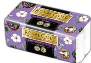
Royal Gold Toilet Roll (Elegant/ Luxurious) 20 x (200/210)s