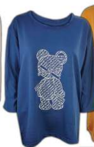
Lovine Ladies Blouse Size:L-XL Assorted Design & Colours