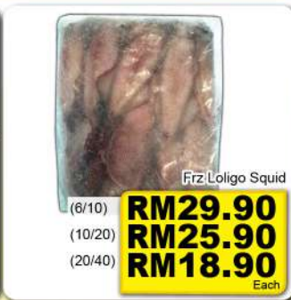
Frz Loligo Squid

(6/10) RM29.90 (10/20) RM25.90 (20/40) RM18.90 Each