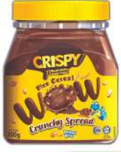
Crispy Crunchy Spread 200gm