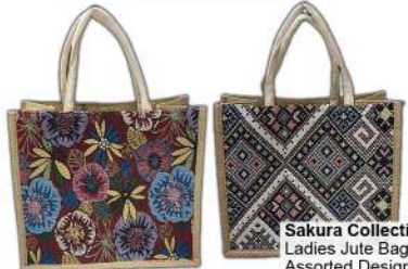
Sakura Collection Ladies Jute Bag Assorted Design & Colours