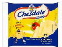
Chesdale Cheddar Cheese/ Trim 250gm