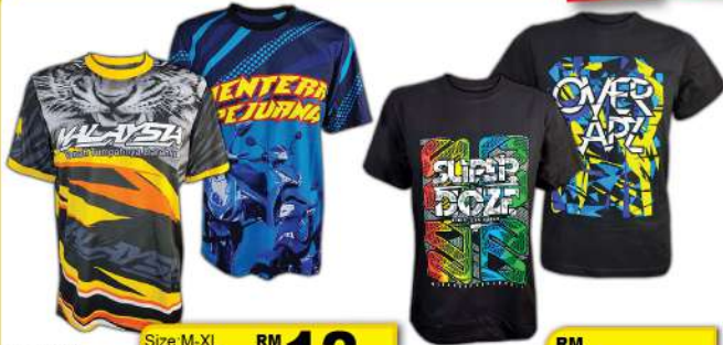
Glory 10 Men Sport T-Shirt Assorted Design & Colours