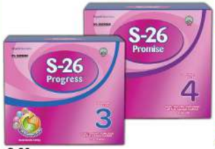
S-26 1.65Kg -Progress -Promise