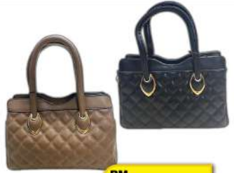
Sakura Collection Ladies Bag Assorted Design & Colours