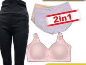
Ladies Maternity Wear Size:L-XL/Free Size Assorted Design & Colours 1s/2s