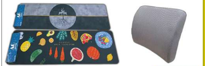
AC Lifestyle Soft Mat Size:40x120cm Assorted Design