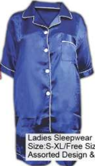
Ladies Sleepwear Size:S-XL/Free Size Assorted Design & Colours