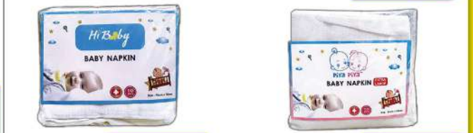
Hi Baby Baby Napkin 10's (Plain) Size:76x76cm