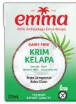
Emma Coconut Cream 200ml