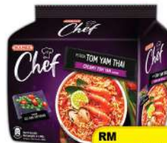
Mamee Chef Instant Noodles (Assorted) 4s x (80/89)gm 8 x 4s x (80/89)gm