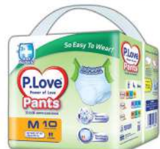
P.Love Adult Pants (M10/ L10/ XL8)