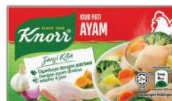
Knorr Seasoning Cubes (Assorted) (Exclude Nam Range) 6 Cubes