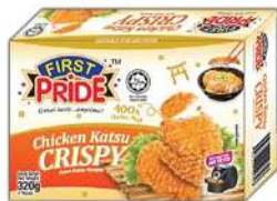
First Pride Crispy Chicken Katsu (Original/Spicy) 320gm