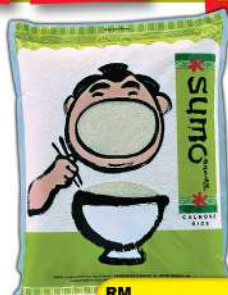
Sumo Calrose Rice 5kg