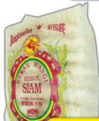
Flying Horse Bihun 1.5Kg