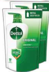
Dettol Shower Gel (Refill Pack) (Original/ Cool/ Lasting Fresh/ Gentle Care) 2 x 850ml