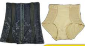
Ladies Shapewear Size:S-3XL Assorted Design & Colours