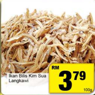
Ikan Bilis Kim Sua Langkawi