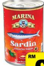
Marina Sardine 425gm 24 x 425gm