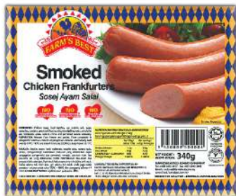
Farm's Best Smoked Frankfurter 340gm