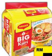
Maggi Big Instant Noodles (Assorted) 5s x (103-107)gm 8 x 5s x (103-107)gm