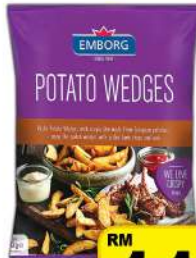
Emborg Potato Wedges 750gm