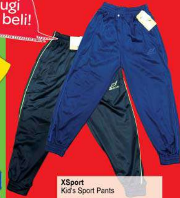
XSport Kid's Sport Pants Size: 26-30/S-XL RM10 Size: 32-36/S-2XL RM12 Assorted Design & Colors