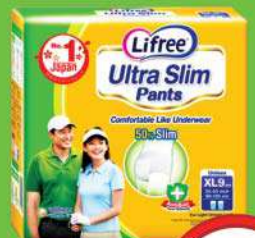
Lifree Adult Pant M10 / L9 / XL9