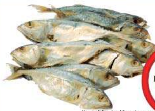
Ikan Masin Kembang