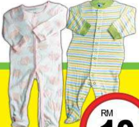
Piya Piya Baby Jumpsuit Size: 3-12 Assorted Design & Colors