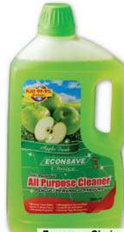
Econsave Choice Anti Bacterial All Purpose Cleaner ( Assorted ) 3 Litres