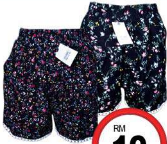
Ladies Short Pants Size: M-XL/Free Size Assorted Design & Colors