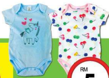
Piya Piya Baby Romper Size: 3-12 Assorted Design & Colors