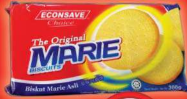
Econsave Choice Marie Biscuit 300gm