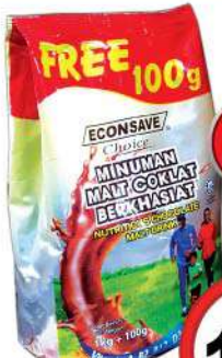
Econsave Choice Choco Malt Drink 1 Kg