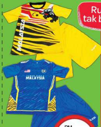
XSport Kid's Sport Suit Size: 6-16 Assorted Design & Colors