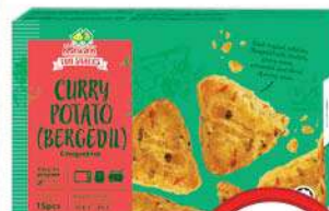
Kawan Potato Croquettes (Assorted) 250gm