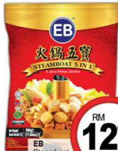
EB Steamboat 5in 1 500gm