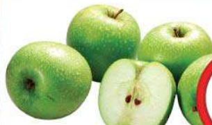
Epal Hijau (M)