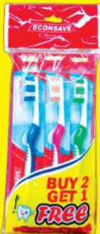
Econsave Toothbrush ( 332/ 326/ 814/ 803 ) 2+1