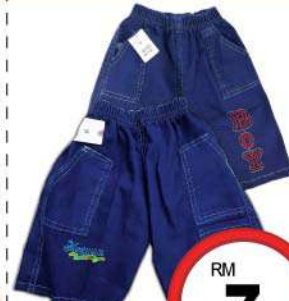
Kid's Place Boy Pants Size: S-L Assorted Design & Colors