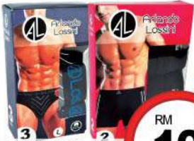
Arlando Lossini Men Brief/Trunk Size: S-5XL Assorted Design & Colors 2's/3's