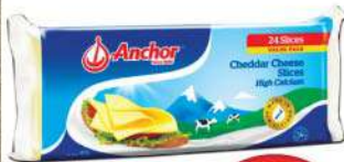
Anchor Cheddar Cheese Slices 400gm