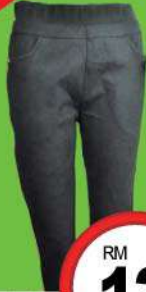
Sakura Collection Ladies Long Pants Size: XS-XL Assorted Colors