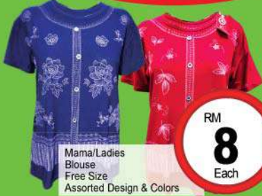
Mama/Ladies Blouse Free Size Assorted Design & Colors