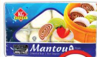
KG Mantou (Assorted) 400gm