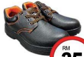
Lowtop Safety Shoes Size: 40-45