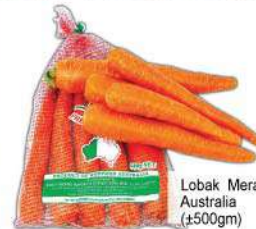
Lobak Merah Australia (±500gm)