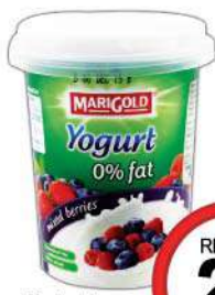
Marigold Fat Free Yogurt (Assorted) 130gm