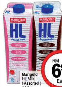
Marigold HL Milk (Assorted) 1 Litre