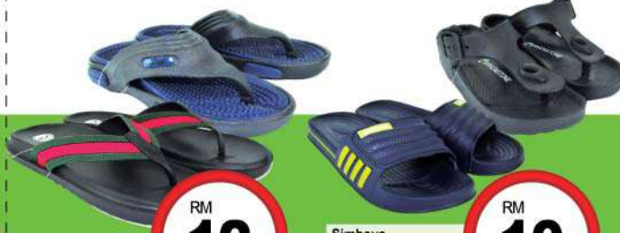
Men & Ladies Slippers/Sandals Size: 40-45/35-41 Assorted Design & Colors