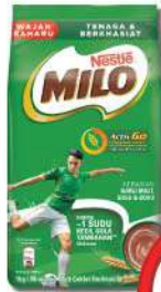
Milo Activ-Go 1 Kg