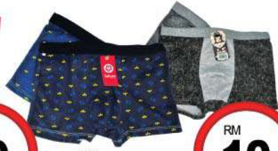
E&S Men Trunk Size: S-XL Assorted Design & Colors 2's