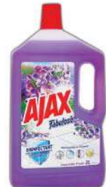
Ajax Fabuloso Floor Cleaner ( Assorted ) 3 Litres