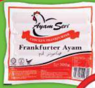
Ayam A1 Seri Frankfurter 350gm