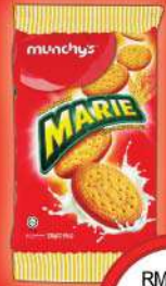
Munchy's Marie ( Original/ Cappuccino ) 300gm