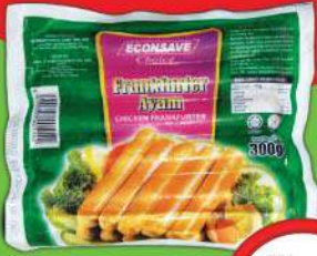
Econsave Choice Chicken Frankfurter 350gm