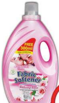
Econsave Choice Fabric Softener ( Assorted ) 3 Litres