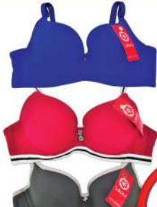
Sakura Collection Ladies Bra Size: 32-42 Assorted Design & Colors