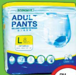
Econsave Adult Pant M10 / L8 / XL8