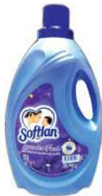
Softlan Fabric Softener ( Assorted ) 2.5 Litres - 3 Litres