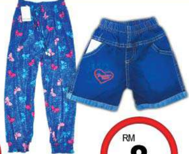
Kid's Place Girl Pants Size: S-2XL Assorted Design & Colors