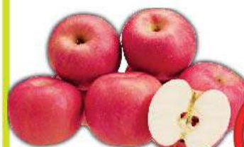
Epal Fuji (M)