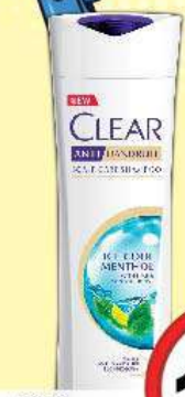
Clear Shampoo (Assorted) 315 ml - 330 ml