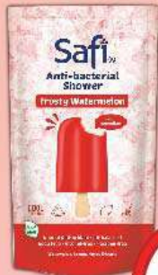
Safi Shower Gel (Assorted) 850 gm