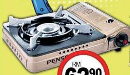
Pensonic Portable Gas Stove PPG-2003N