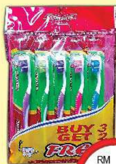
Econsave Toothbrush Adult Fresh / Charcoal 5004 / 637 3+2