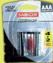
Sabichi Alkaline Batteries 4AA Free 2AA/ 4AAA Free 2AAA