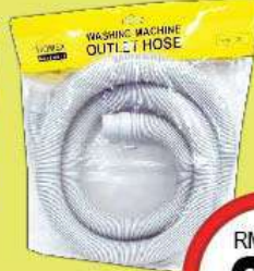
PE Washing Machine Outlet Hose FH3400 2 M