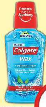
Colgate Plax Mouth Wash (Assorted) 250ml