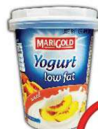
Marigold Low Fat Yogurt Cup (Assorted) 130 gm