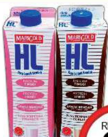
Marigold HL Milk (Assorted) (Except Steros Plus Milk) 1 Litre