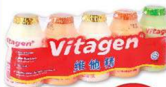
Vitagen Cultured Milk (Assorted) (Except Less Sugar) 5 x 125 ml