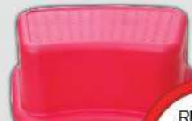
Step Stool RU1612 Size: (36 x 24 x 13.5)cm (Exclude Bintangor)