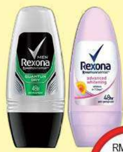
Rexona Roll On (Assorted) 50 ml