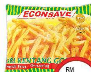
Econsave Choice French Fries - Shoestring / Crinkle Cut 1 Kg