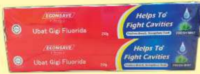
Econsave Choice Fresh Mint Toothpaste 2 x 250 gm