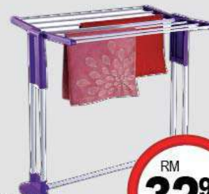
E&S Home White Cloth Dryer LBIM DC-106G (Decorative Items Not Included)