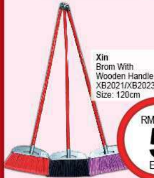
Xin Brom With Wooden Handle XB2021/XB2023 Size: 120cm