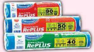
Sekoplas Replus Size: S 47cm x 54cm 90's Size: M 68cm x 84cm 50's Size: L 75cm x 90cm 40's (Exclude Bintangor)