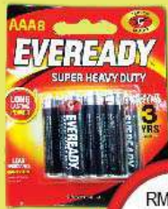
Eveready Super Heavy Duty Batteries 8AA/8AAA