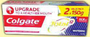
Colgate Total Toothpaste (Assorted) 2 x 150 gm