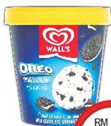
Wall's Selection (Assorted) 750 ml