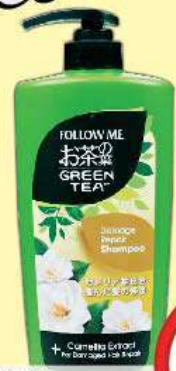
Follow Me - Shampoo / Conditioner (Assorted) 650 ml