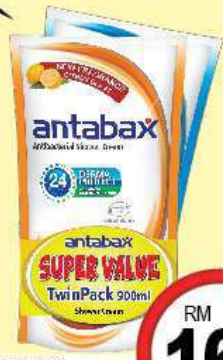
Antabax Shower Cream (Assorted) 2 x 900 ml