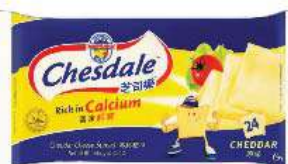
Chesdale Cheese Slice 500 gm