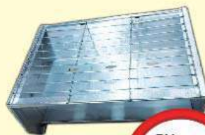
BBQ Grill (L) BBQ002 Size: 28"