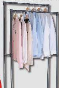
Eonsave Double Garment Rack GDY YJ3090 (Decorative Items Not Included)