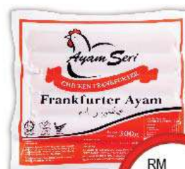
Ayam Seri Chicken Frankfurter 300gm