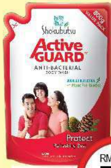
Shokubutsu Shower Form (Refill Pack) (Assorted) 800 g / 850 g