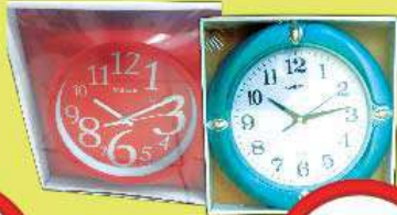
Sabichi Wall Clock 2013C4/0095A1/ 697A1/694A1/701A1