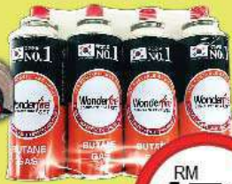
Woodenfire Gas Cartridge Refill WF230 4's