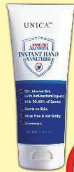
Unicat Hand Sanitizer 100 ml