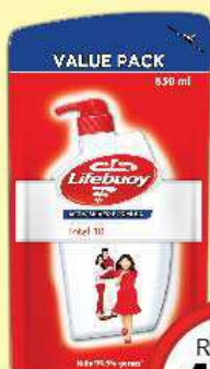
Lifebuoy Bodywash (Refill Pack) (Assorted) 850 ml