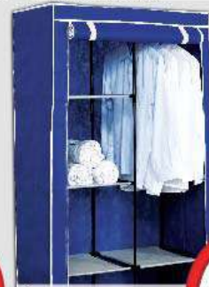
Eonsave Wardrobe With 6 Compartments K13135B (Decorative Items Not Included)