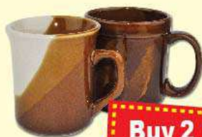
Stoneware Mug 2783 Size: 7oz 2784 Size: 8oz (Exclude Bintangor)