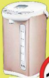
Faber Thermopot Fantasia 505 Size: 5 Litres