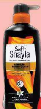
Safi Shayla Shampoo (Assorted) 520 gm