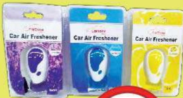
Sport Car Air Freshener JY-D01B Assorted 15ml (Exclude Bintangor)