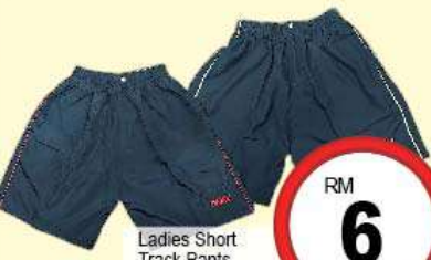
Ladies Short Track Pants Free Size Assorted Colors