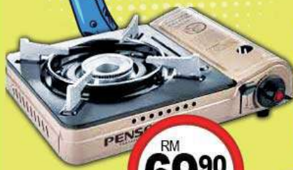
Pensonic Portable Gas Stove PPG-2003N