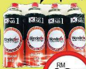
Woodenfire Gas Cartridge Refill WF230 4's