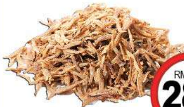
Ikan Bilis Kopek