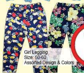
Girl Legging Size: 50-60 Assorted Design & Colors