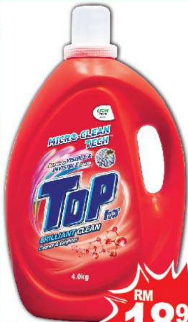
Top Laundry Detergent (Assorted) 4 Kg