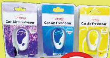
Sport Car Air Freshener JY-D01B Assorted 15ml