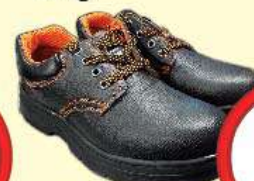
Lowtop Safety Shoes Size: 40-45