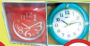
Sabichi Wall Clock 2013C4/0095A1/ 697A1/694A1/701A1