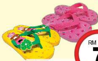
Kid's Slippers Size: 24-35/7-8.5 Assorted Design & Colors