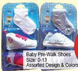
Baby Pre-Walk Shoes Size: 0-13 Assorted Design & Colors