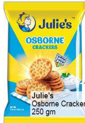
Julie's Osborne Crackers 250 gm