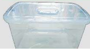
Transparent Storage Box With Handle JJB 510 Size: (38x26.5x20.5)cm JJB 511 Size: (42x29.5x22.5)cm JJB 516 Size: (44x30.5x24)cm