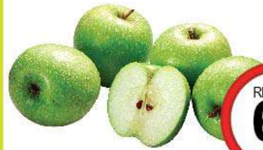
Epal Hijau (M)