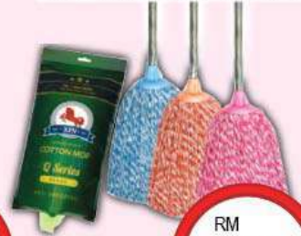
Xin Semicolor Mop With Metal Handle XXL 800QC/W