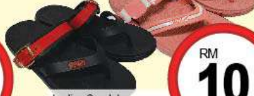
Ladies Sandals Size: 35-41 Assorted Design & Colors