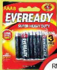
Eveready Super Heavy Duty Batteries 8AA/8AAA