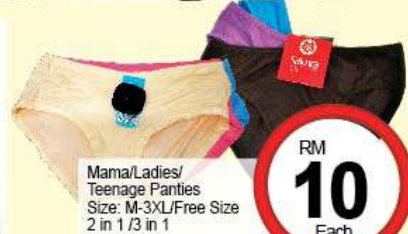
Mama/Ladies/ Teenage Panties Size: M-3XL/Free Size 2 in 1/3 in 1 Assorted Design & Colors