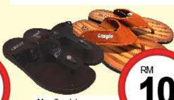
Men Sandals Size: 40-45 Assorted Design & Colors