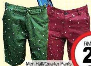
Men Half/Quarter Pants Size: 30-38/2XL-5XL Assorted Design & Colors