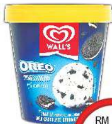
Wall's Selection (Assorted) 750 ml