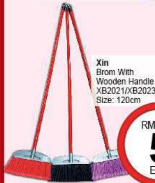
Xin Brom With Wooden Handle XB2021/XB2023 Size: 120cm