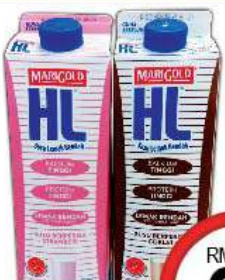
Marigold HL Milk (Assorted) (Except Steros Plus Milk) 1 Litre