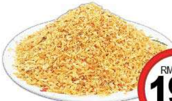
Udang Kering Halus