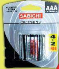
Sabichi Alkaline Batteries 4AA Free 2AA/ 4AAA Free 2AAA