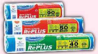
Sekoplas Replus Size: S 47cm x 54cm 90's Size: M 68cm x 84cm 50's Size: L 75cm x 90cm 40's