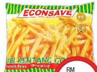
Econsave Choice French Fries - Shoestring / Crinkle Cut 1 Kg