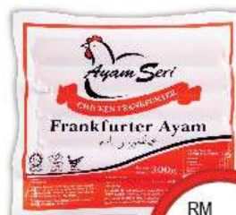
Ayam Seri Chicken Frankfurter 300gm