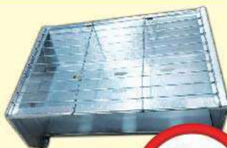
BBQ Grill (L) BBQ002 Size: 28"