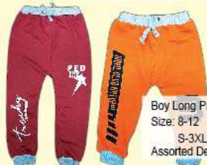
Boy Long Pants Size: 8-12 S-3XL Assorted Design & Colors