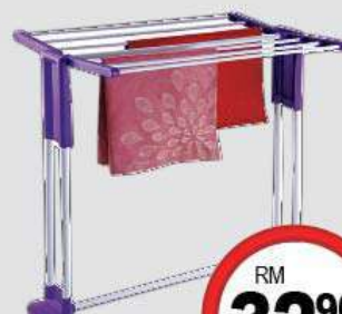
E&S Home White Cloth Dryer LBIM DC-106G (Decorative Items Not Included)