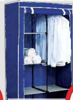
Eonsave Wardrobe With 6 Compartments K13135B (Decorative Items Not Included)