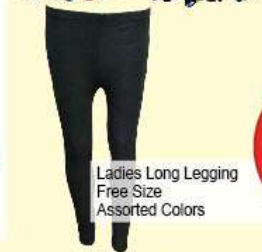
Ladies Long Legging Free Size Assorted Colors