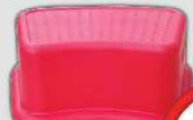
Step Stool RU1612 Size: (36 x 24 x 13.5)cm