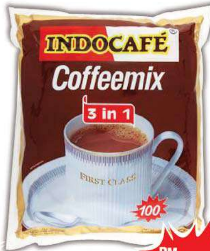
Indocafe Coffeemix 3 In 1 100's x 20 gm