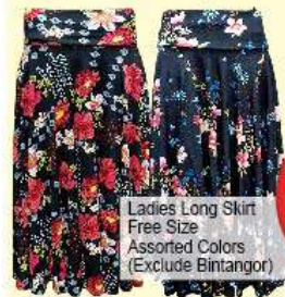
Ladies Long Skirt Free Size Assorted Colors (Exclude Bintangor)