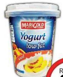
Marigold Low Fat Yogurt Cup (Assorted) 130 gm