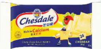
Chesdale Cheese Slice 500 gm