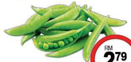
Kacang Peas Manis