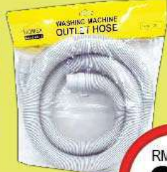
PE Washing Machine Outlet Hose FH3400 2 M