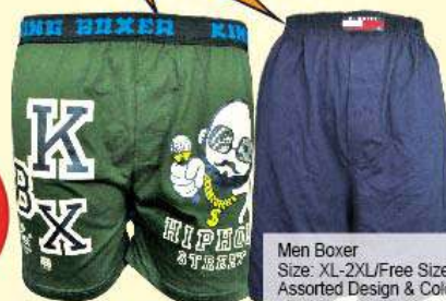
Men Boxer Size: XL-2XL/Free Size Assorted Design & Colors