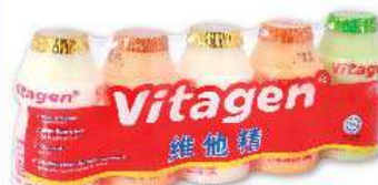
Vitagen Cultured Milk (Assorted) (Except Less Sugar) 5 x 125 ml