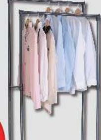
Eonsave Double Garment Rack GDY YJ3090 (Decorative Items Not Included)