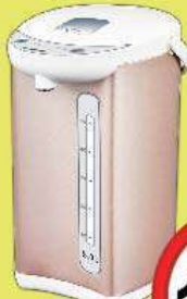
Faber Thermopot Fantasia 505 Size: 5 Litres