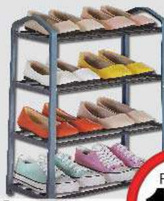
Eonsave 4 Tiers Shoe Rack XJ42K Size: (42 x 20 x 62)cm (Decorative Items Not Included)