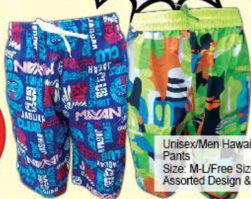
Unisex/Men Hawaii Pants Size: M-L/Free Size Assorted Design & Colors