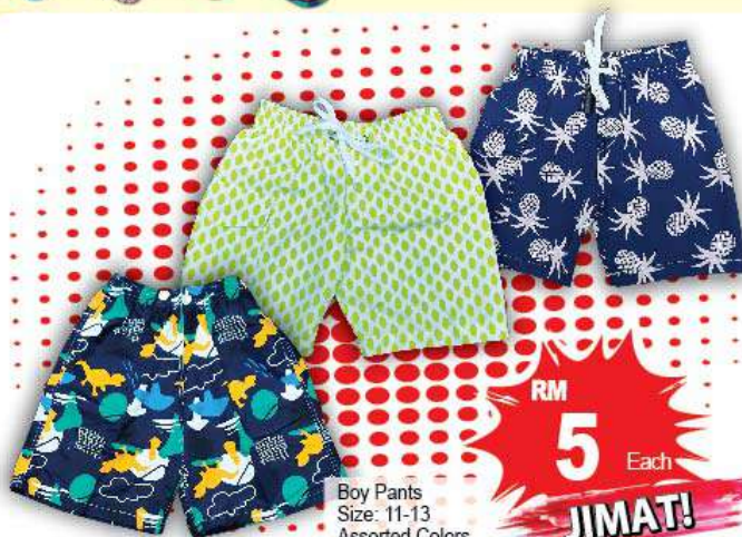
Boy Pants Size: 11-13 Assorted Colors