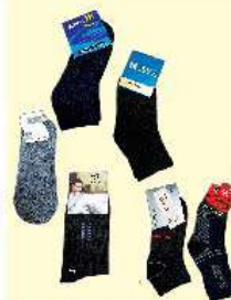
Men & Ladies & Kids Socks Size: 15-28 Assorted Design & Colors